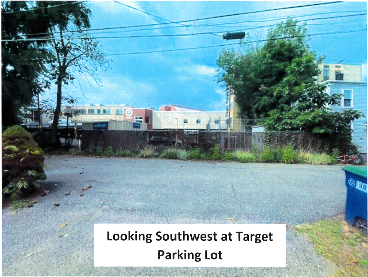
Looking Southwest at Target Parking Lot