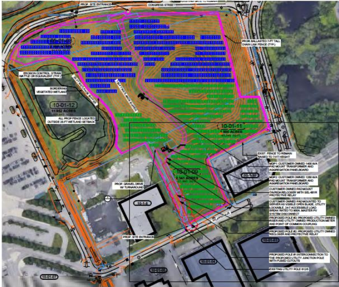
1 SITE PLAN - 134 COMMERCE WAY, WOBURN: 3.409 MWDC PV SYSTEM USING JINKO MODULES NOT TO SCALE