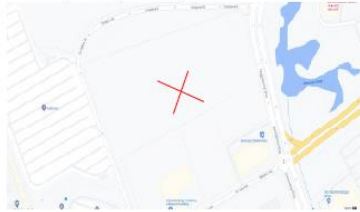
2 LOCUS MAP NOT TO SCALE