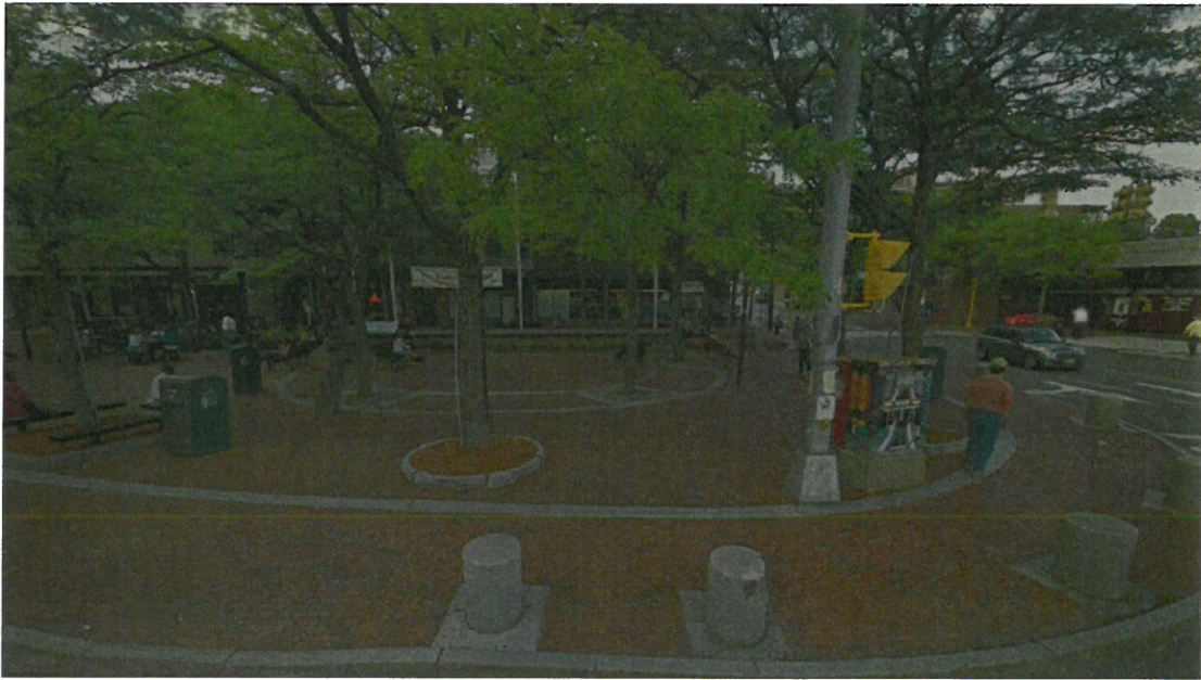
Figure 1: Davis Square Park. The entire event, including live music and art market, will take place in this area. At right in the figure is College St., where art market tables will be set up.

Bands and a PA system will be set up in Davis Square Park in the events circle (see Figure 1 ). The audience will convene around this area. Art market tables will be set up at the perimeter of the park along College St.