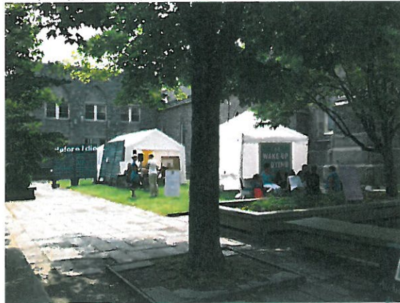
A close up of the interior of the listening tent