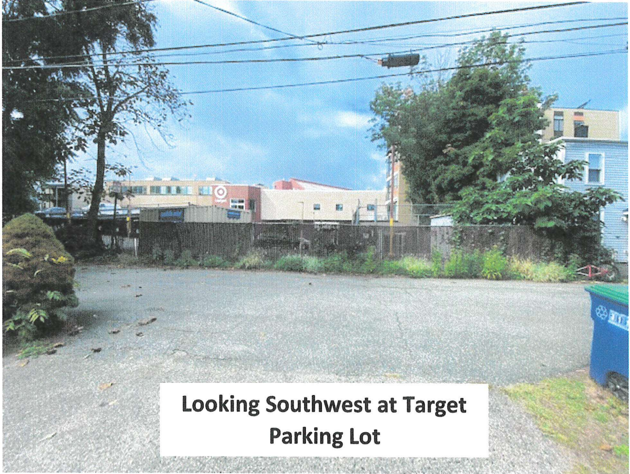
Looking Southwest at Target Parking Lot