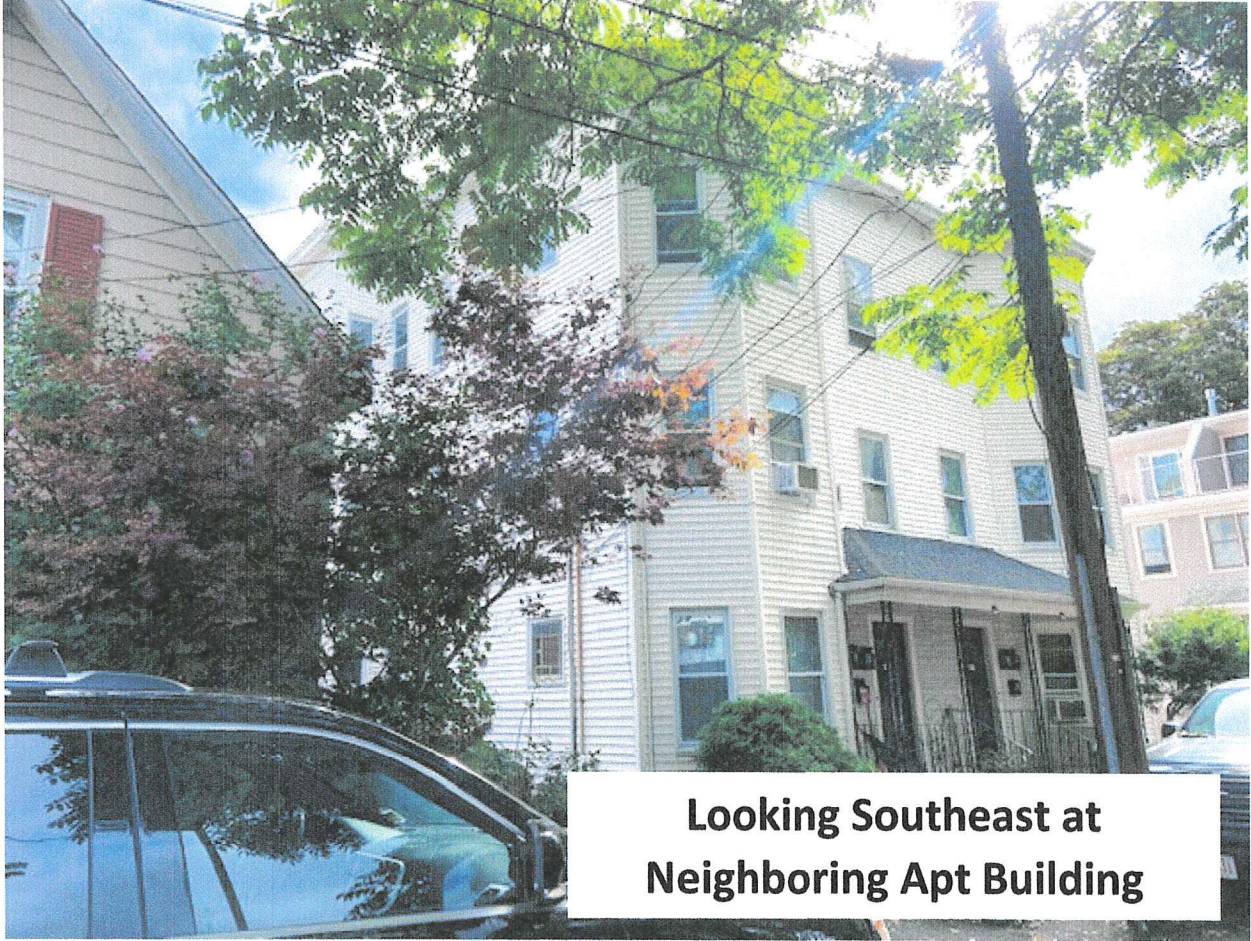
Looking Southeast at Neighboring Apt Building