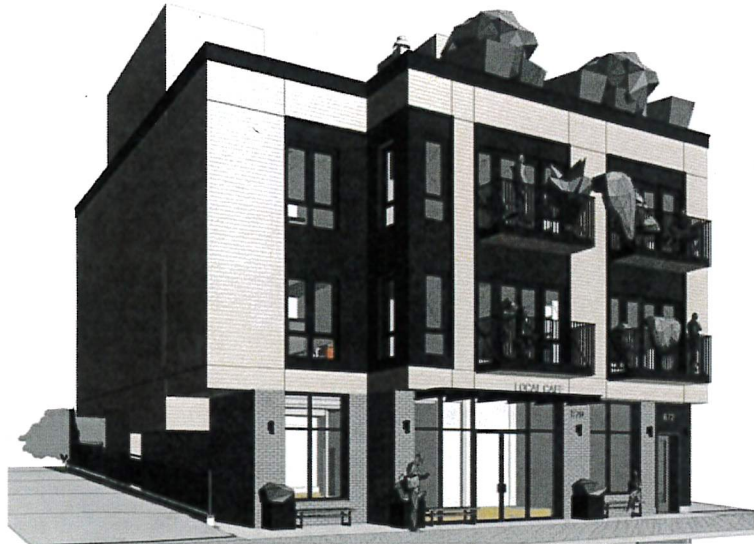
1 Exterior Front Perspective 1