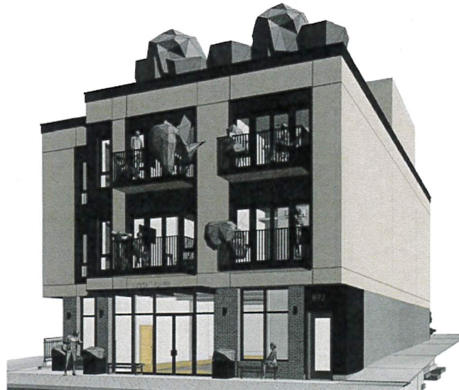
2 Exterior Front Perspective 2