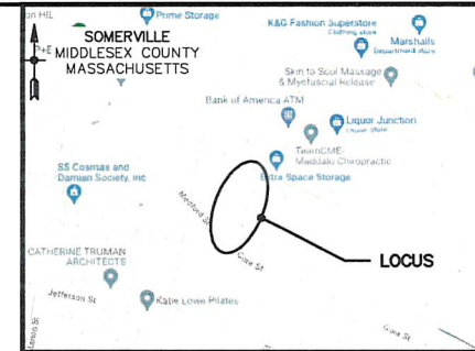
LOCUS MAP NOT TO SCALE