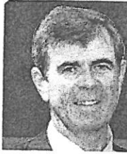
William Francis Galvin Secretary of the Commonwealth of Massachusetts