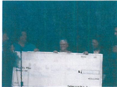
$15,000.00 donation was made on November 2, 2011 to Toys For Local Children @ The Burren

Somerville High School Football Program Somerville High School Soccer Program Somerville High School Frisbee Program Medford High School Track Program Wakefield High School Track Program Boston Triathlon Team Breast Cancer Fund