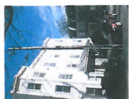
POLE #15 SOMERVILLE AVE