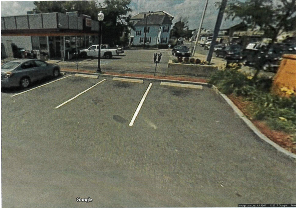
HP SPOT LOCATION above