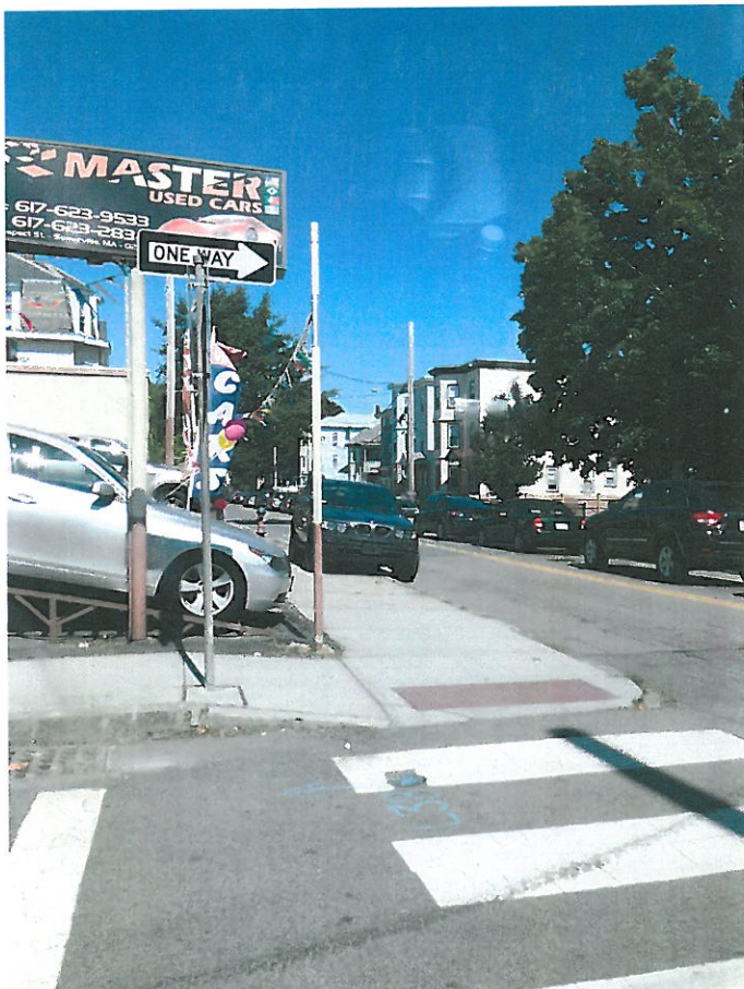
Figure 3 Master Motors Sat, Sept 7, 2013 12 noon. Prospect St bumper to bumper heading into Union Sq, car on sidewalk obstructing Cambridge bound traffic