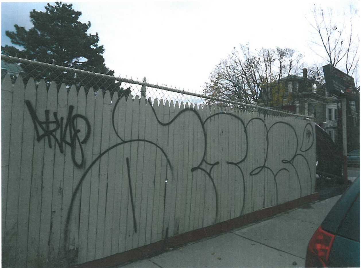
Figure 2 Graffiti master Motors Nov 2011