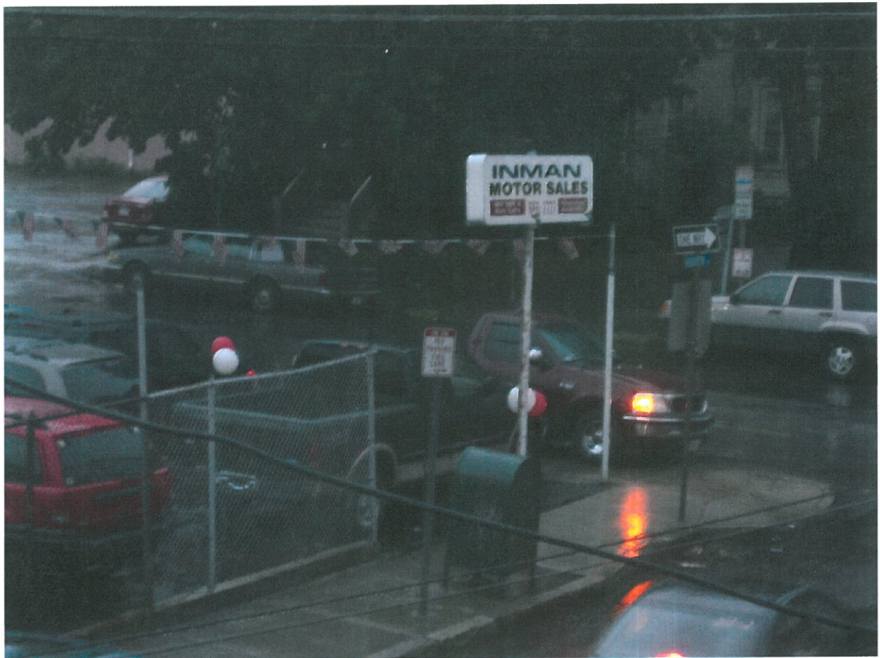
Figure 4 July 7, 2005