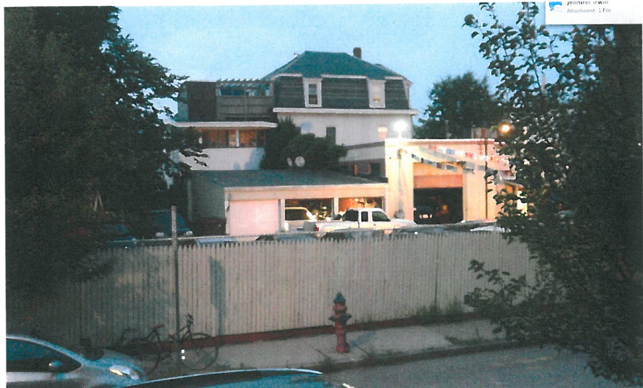
Figure 1MASTER MOTORS Aug 19, 213 7.48pm open and working