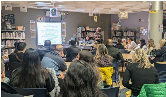
PK and K enrollment info session for families in Nov 2024

District Enrollment is expected to continue rising over the summer. Last year, 138 students registered between June 1 and August 30 in 2024.