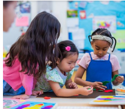
Somerville Public Schools' Strategic Plan 2024