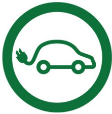
Figure 1: City of Boston's Wayfinding Logo for General Service EVSE Signage.

Signage shall be placed at the parking entrance notifying the presence of EVSE. The City of Boston's Wayfinding Logo sign shall be used for General Service EVSE signage. A link to a high resolution graphic can be found at www.boston.gov/recharge-boston