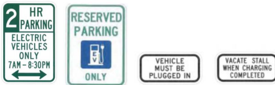
Figure 2: (Labeled Left to Right A-D) Example EVSE regulatory signs.

Regulatory signs should be no smaller than 12" x 18" and placed immediately adjacent to the EVSE at a height of 7 feet.