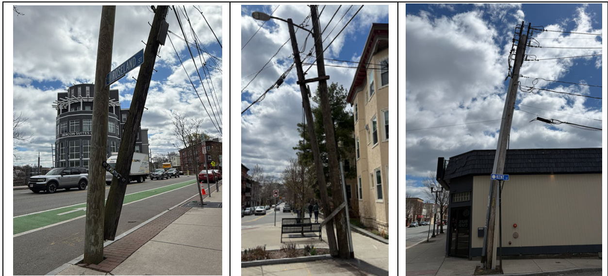
Figure 4: Doubled poles near the intersection of Somerville Ave and Beacon Street, and the leaning pole at Somerville and Kent

Below, I share a couple more images of doubled poles near the intersection of Beacon and Somerville Ave, as well as the comical lean of the row of the pole at Kent and Somerville Ave.