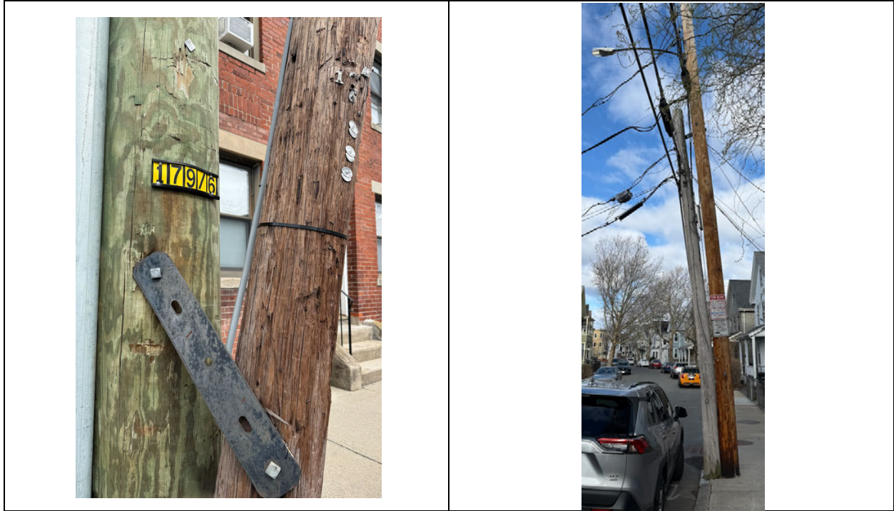
Figure 3: The doubled poles at either end of Ivaloo Street.

situation. Using the example of the two doubled poles on the block where I live: pole 179/6 (near Ivaloo and Beacon) dates from 2023, and pole 179/3 (at the intersection of Harrison and Ivaloo) dates from 2015. Even three years seems like a long time for a “temporary” solution to persist. At eleven years, referring to a doubled pole as “temporary” is frankly insulting.