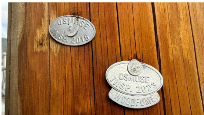
Figure 2: Medallions on pole 179/3 indicating that it was inspected in 2015 and again in 2023.

Despite verbal assurances from the Eversource representative at the time, no care was taken. The tree eventually suffered enough damage that it had to be removed. In the years since then, I have appreciated the efforts by various Councilors - however ineffective those efforts have been - to encourage Eversource to perform timely maintenance of their equipment, including accelerating the removal of doubled utility poles. While I understand that several companies must coordinate to move all the wires, Eversource clearly feels no urgency about this unsightly and occasionally dangerous situation.