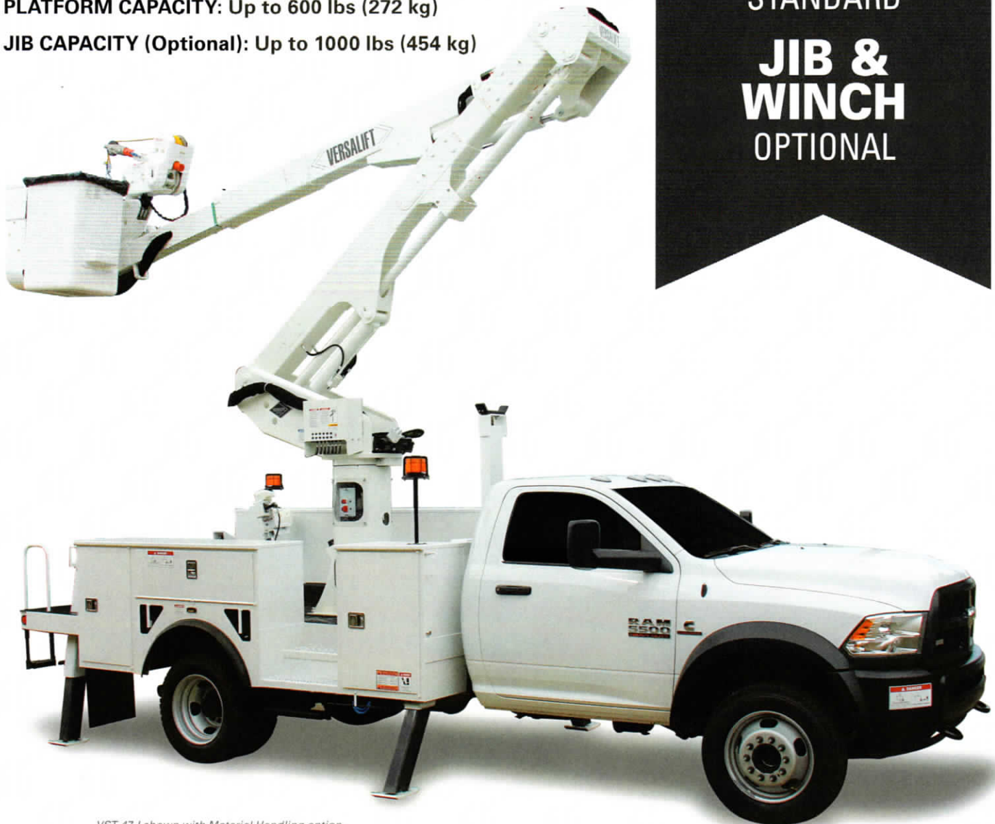
VST-47-I shown with Material Handling option.

JIB CAPACITY (Optional): Up to 1000 lbs (454 kg)