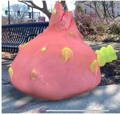
A small-scale test version of the virus that is coming to Davis Square at ArtBeat.

Don't worry! We've also got heaps of fantastic music, dance, food, activities lined up. Stay tuned!