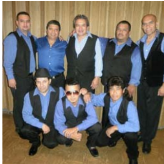
The ever-dapper Grupo Los Nitidos will be performing at Carnival this Sunday in East Somerville.

Head on down to "Eastie" this Sunday (June 2) for Carnival. From 2-6pm on Broadway between McGrath Highway and Pennsylvania Ave. We'll have two stages of music, interactive activities, a flea and artisan market - and a slew of community organizations. Carnival is organized by the City of Somerville, the Somerville Arts Council, and East Somerville Main Streets.