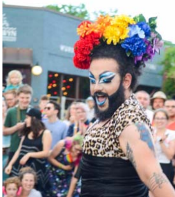
Get out your blue eye shadow and come on down to Union Square to kick off Pride Month!

The Somerville Arts Council is thrilled to announce the third annual Big Gay Dance Party , as part of its ArtsUnion Series. There will be great beats and performers, as well as local organizations who will be there to share their information. If you haven't been to this ridiculously fabulous and boisterous event before, you're missing out!