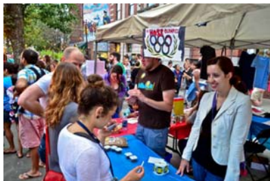
Volunteers running the Nose Olympics spice-smelling booth at Ignite last year.

The warm weather is upon us and that means our non-stop festival machine is in motion. Two of our biggest festivals are ArtBeat and Ignite, and we'd be tickled if you'd consider helping us out and volunteering. Thanks in advance!