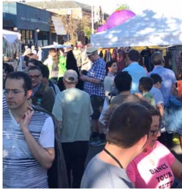
The Union Square night market was packed; we're hoping for equally lively scenes at our two upcoming markets!

We have teamed up with the awesome folks at the Somerville Flea to present a trio of night markets into the mix this season. The first one took place in Union Square on the evening following Porchfest, and was a massive success.