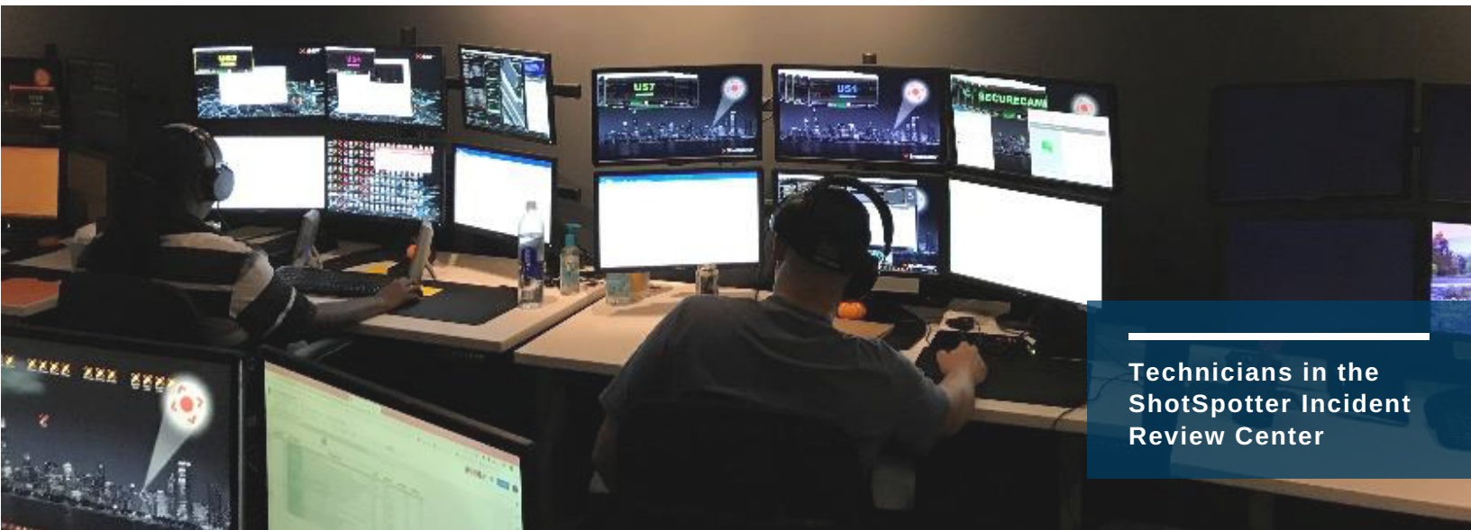
Technicians in the ShotSpotter Incident Review Center

notifications from customer locations around the world to determine whether the impulsive sounds detected by the ShotSpotter algorithm are actual gunshots. 6 The IRC is notified of the majority, but not all, of the impulsive sounds that trigger three sensors. As the ShotSpotter algorithm has improved over time, SST has determined that its system is sufficiently accurate in identifying particular types of impulsive sounds, such as helicopters or fireworks, so that these